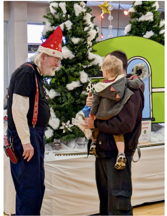
Elf at the USO