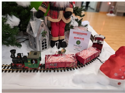
Train at Wright Patterson USO