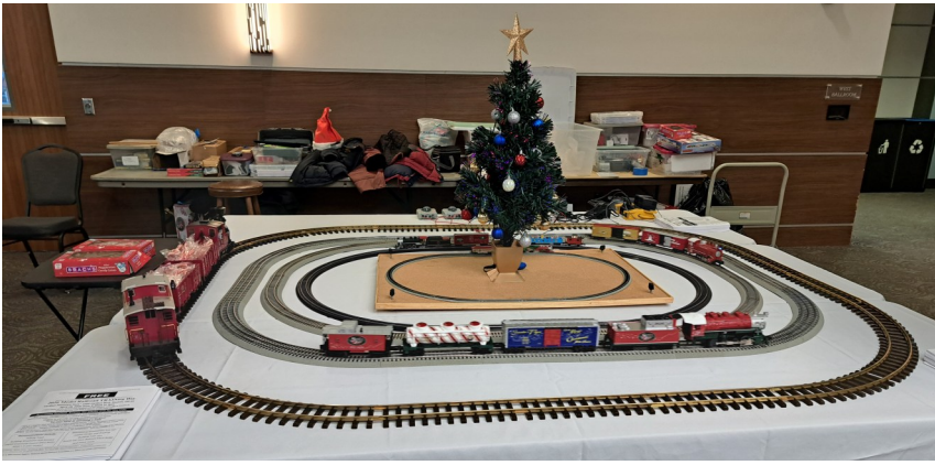
Trains at UD Christmas on Campus